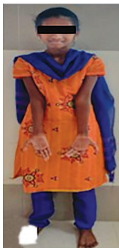
Fig. 2: Generalized wasting was present in all four limbs