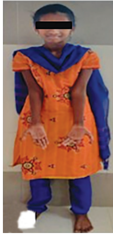
Fig. 2: Generalized wasting was present in all four limbs